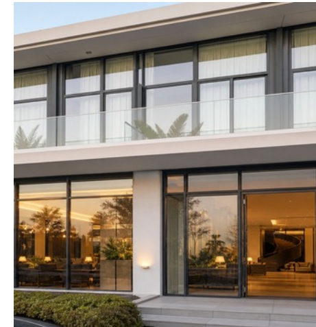
Hotels and resorts

These are project reference scenarios. Specific project names, certifications and performance claims should only be used after confirmation.