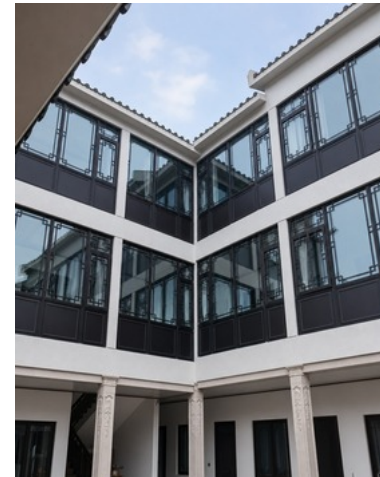
Renovation and balcony upgrade